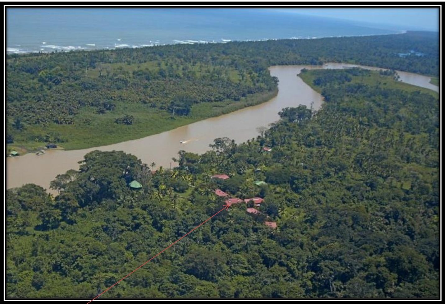
The Lodge is in the Jungle on the Rio Parismina River just before it flows into the Caribbean

We recommend RIPCORD for your Rescue Travel Insurance. They provide a one-stop integrated travel protection program for adventurers and 24/7 contact with medical and security professionals. They are a medical and travel security risk company that provides worldwide evacuation and rescue services from your point of emergency all the way home. www.ripcordrescuetravelinsurance.com/portal/highmtnhunts