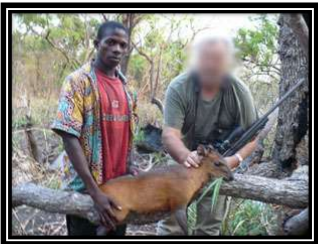
Bay Duiker ( Cephalophus dorsalis )