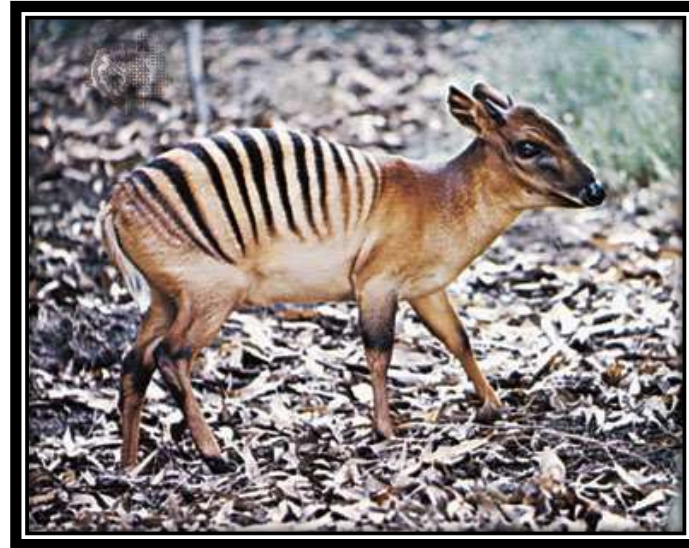
Zebra Duiker (Cephalophus zebra) CITES II

Guinea is new hunting destination, not much is known and not much has been explored by international hunters. The geographic position is between Guinea Bissau, Senegal, Mali, Ivory Coast, Liberia and Sierra Leone. This makes it very interesting for tropical forest hunts, but also for hunts in the arid areas in the north of the country, bordering with Senegal and Mali. The camp in the Forest concession is 618 square miles and has been opened for the first time in recent history. It is on the border with Sierra Leone, about 300km as the crow flies from the capital Conakry. The area is hardly accessible and it can be reached after a 4 hour drive on "tarmac" road and another 5 on African dirt road!