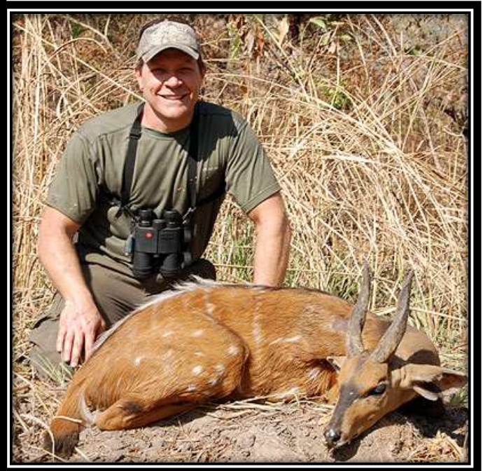
Bushbuck ( Tragelaphus scriptus )