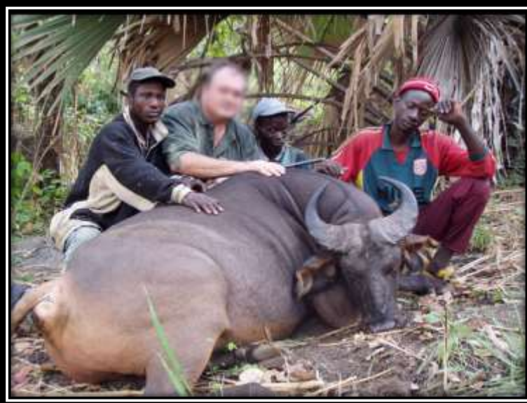
Dwarf Forest Buffalo ( synlerus caffer nanus )