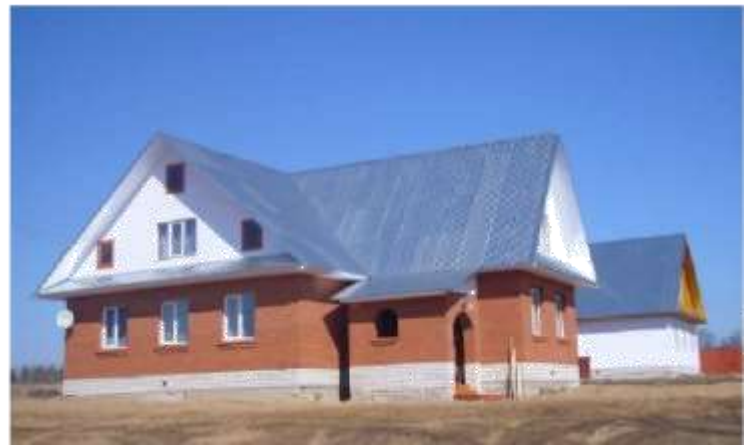
House in Tver Area