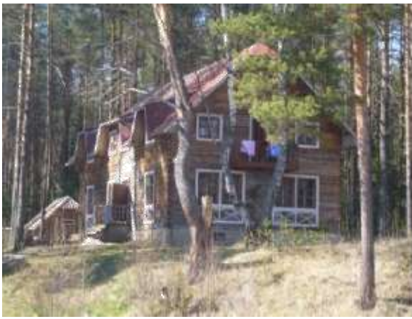
House in Vologda Area